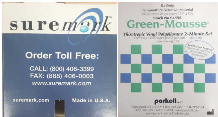
Left: Scanning dots by Suremark. Right: Green Moose by Parkell

Upper Left and Upper Right: Impression taken with the denture replica and Green Moose. Scanning dots attached. Lower Left and Lower Right: Scanning dots (red arrows) and Green Moose (blue arrows) as seen on the CT scan